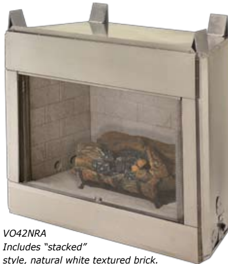
VO42NRA Includes "stacked" style, natural white textured brick.