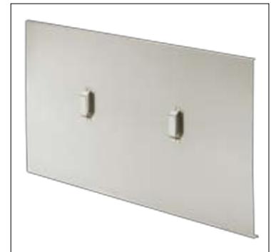
Accessories include a matching stainless steel fireplace cover to protect against weather and dirt, as well as unwelcome animals and pests.