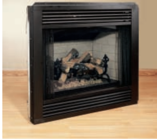
Vanguard's Performance Line Direct-Vent

A Vanguard Direct-Vent Gas Fireplace System offers you an economical and convenient way to add the beauty of a fireplace to your home. These elegant fireplaces offer every advantage you could desire: unsurpassed log and flame beauty, versatile installation options, value added features and state of the art safety systems. There is also a complete line of accessories available.