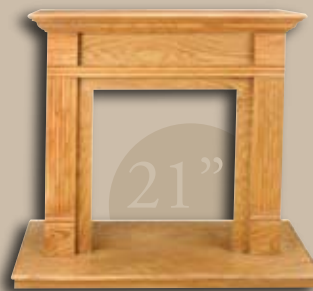
Traditional - Single Molding 21" Wall Mantel, Light Oak Stained (W21AOS)