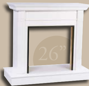
Traditional - Single Molding 26" Wall Mantel, White Paint (CMA210W)