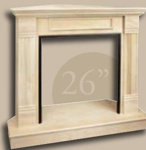
Traditional - Picture Frame 26" Corner Mantel, Unfinished (GMC63UD)