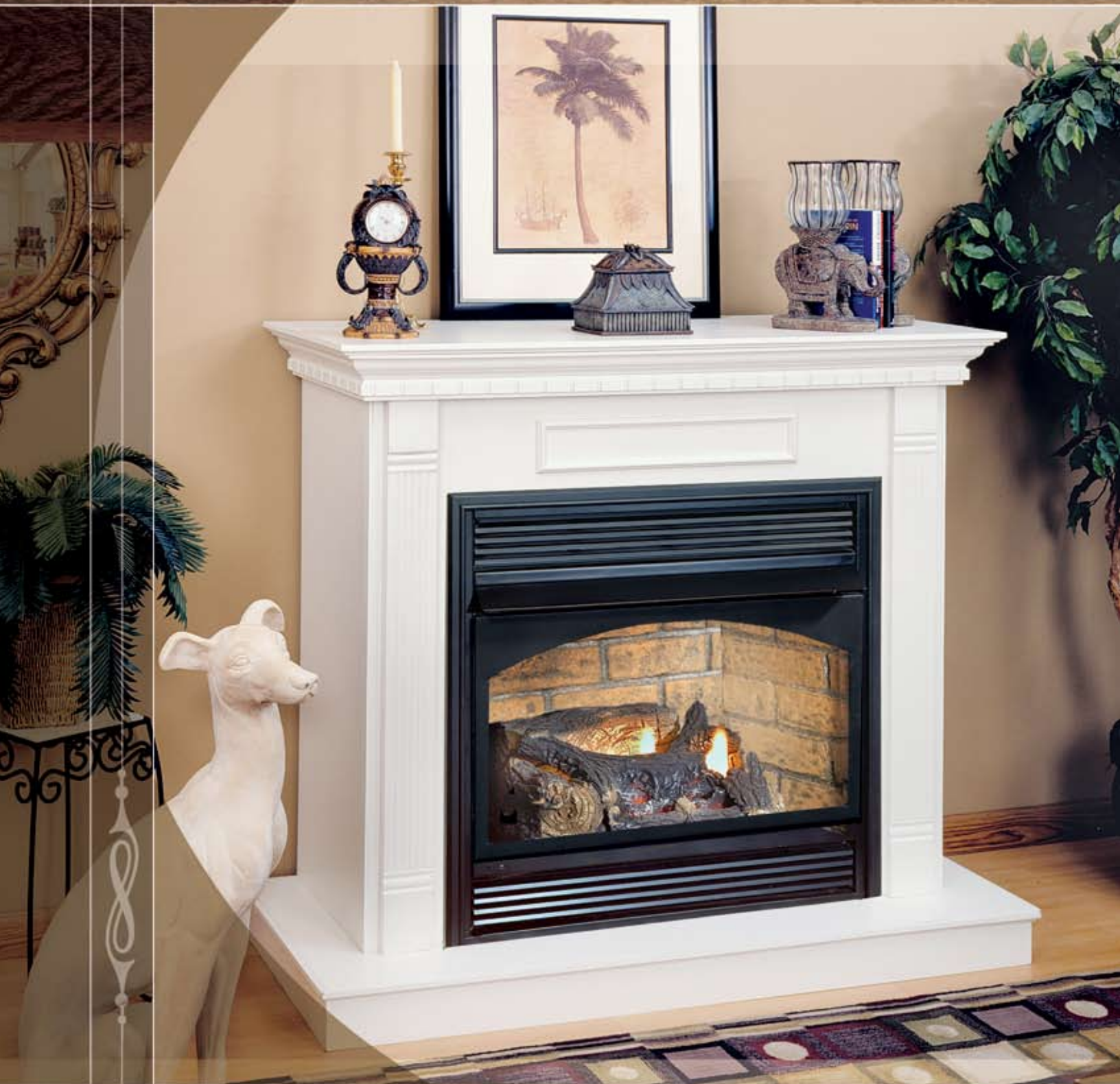
Wall & Corner Cabinet Mantels for Gas & Electric Fireplaces