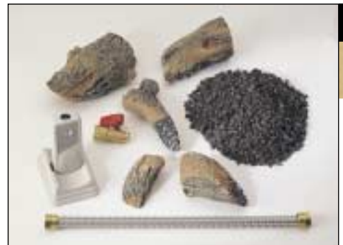
Standard feature components include hand-held remote control