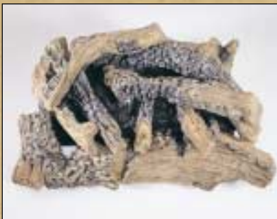
Solid, unitized log set is intricately detailed