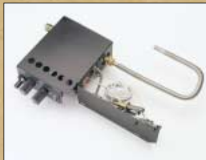
Gas train/ control assembly is fully assembled and factory tested